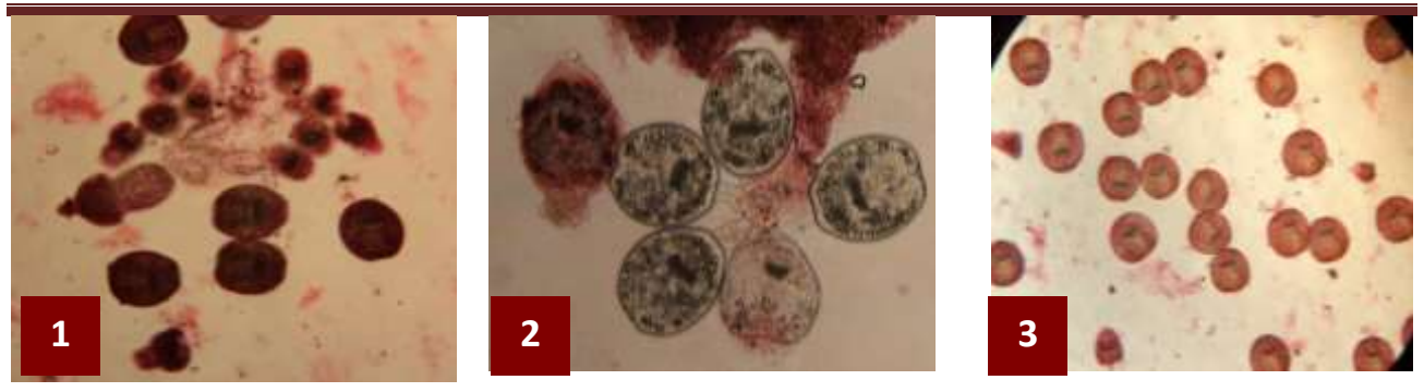
Fig (1):Pictures of treated protoscolices where :3, control group(viable protoscolices ),1,2, protoscolices treated methanol extract of Hapalosiphon welweschii .

The GC – Mass spectrum (Fig,2), table (2) of the methanol extract of H. welweschii revealed that are 22 peaks of different sizes. The results of spectrum showed that Triazolo[1,5-a] pyrimidine carboxylic acid consist 13.28 % of the total methanol extract followed by Diterpine (13.03 %) as illustrated below :