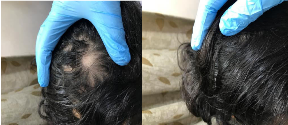
Figure 2: patient with AA (A) before using oral ganciclovir while (B) after the treatment