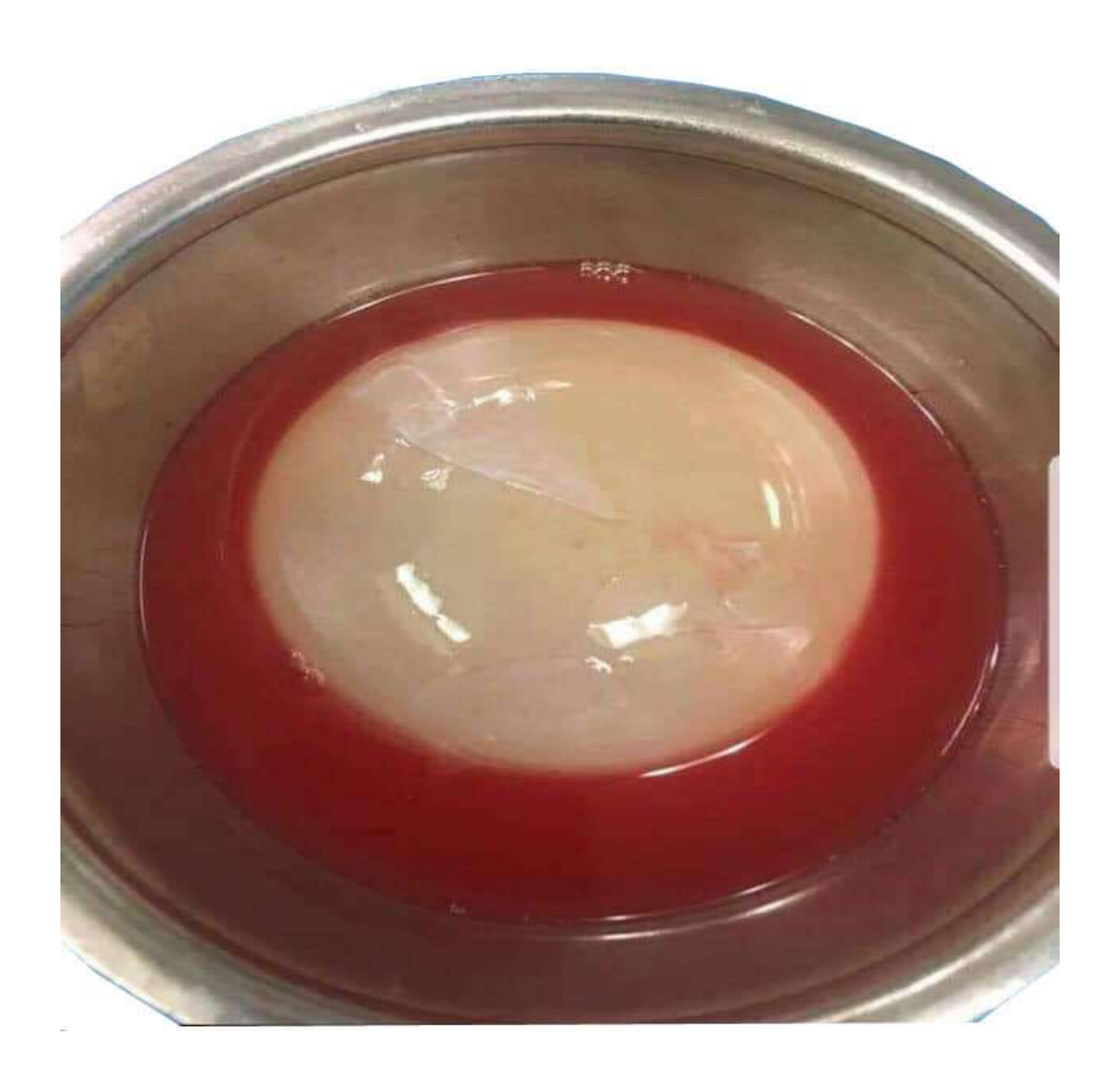
FIG .2: Intraoperative picture showing the exposed hydated cyst (a),and totally removed cyst without rupture(b).