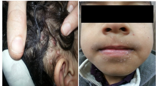
Figure 1: A child present with multiple MC I Lesion

There was also a highly significant statistical difference between the Size of lesions of the M.C. (the M.C. lesions were presented mainly at a size (- 4 2mm) in 87 patients (72.5%) compared to the other side of the( less than 2 mm) in 2 patients (1.7%) in ), (4- 6 mm) in 18 patients (15%), ( 6-8mm) in 10 patients (8.3%) and( more 8 mm) in 3 patients (2.5%) the P value was also < 0.001).